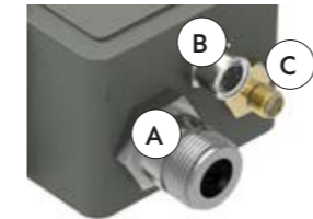
Examples of connectors illustrated

Optional Connector B – M8 (RS485, 4 pin, A-key coded) for Alarm, M&C Connector C – SMA (f) for separate external reference and/or power input.